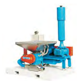
High loading capacity with oundproof Roost Blower 20.000 kg/h