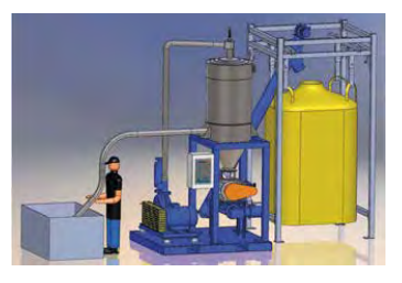
Silo loading units working with the Suction Pressure Principle