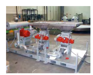
Two different raw material loading at the same time with the Double Chamber Silo Loading Unit SYRB